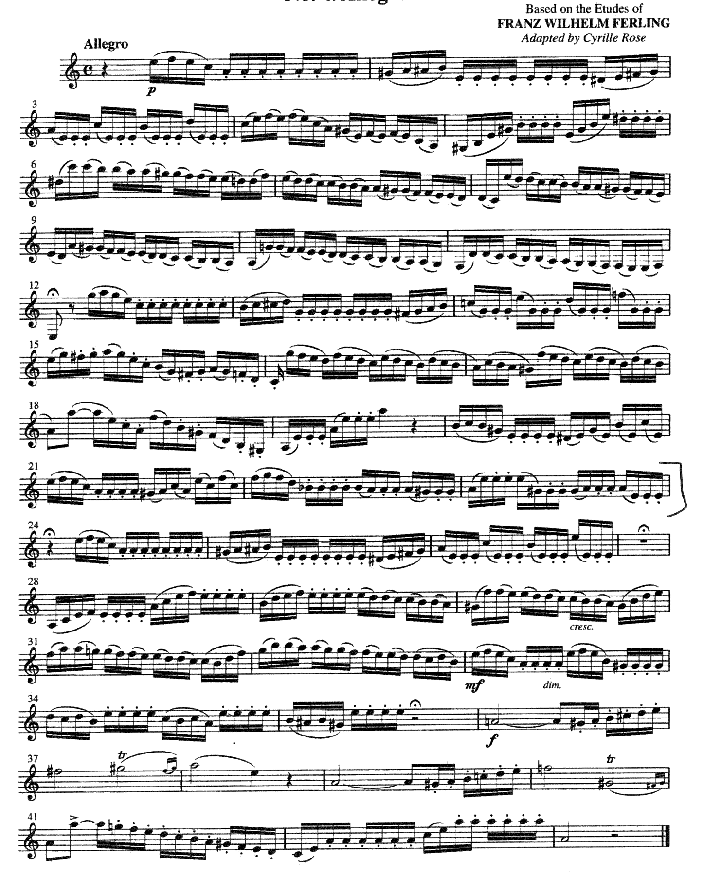
No. 4. Allegro